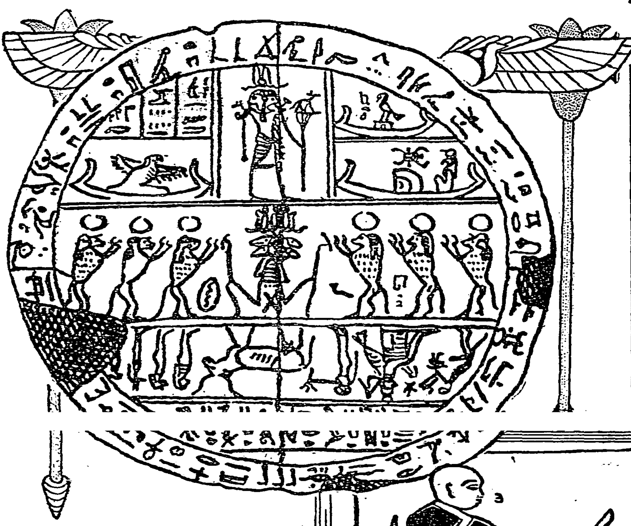
PLATE NO. 1—FROM THE BERLIN MUSEUM COLLECTION. Magic Disk for use under mummy's head. Note similarity to Plate No. 4 from "The Pearl of Great Price."

THE sacred books of the Mormon Church, which this wholly American cult proclaims to have been given divinely to the first Mormon prophet as a solemn addenda to the known Scriptures, have now been in circulation in Mormondom for about seventy years. On their faith that the texts were really produced through the gift and power of God, hundreds of thousands of devotees have hailed Joseph Smith as the "prophet, seer, and revelator" of God, and God's spokesman on earth. His successor, Joseph F. Smith, the present prophet, they hail by the same title, and so strong is their faith that the prophet wields unlimited power in politics, in finance, and in religion in at least two Western States.