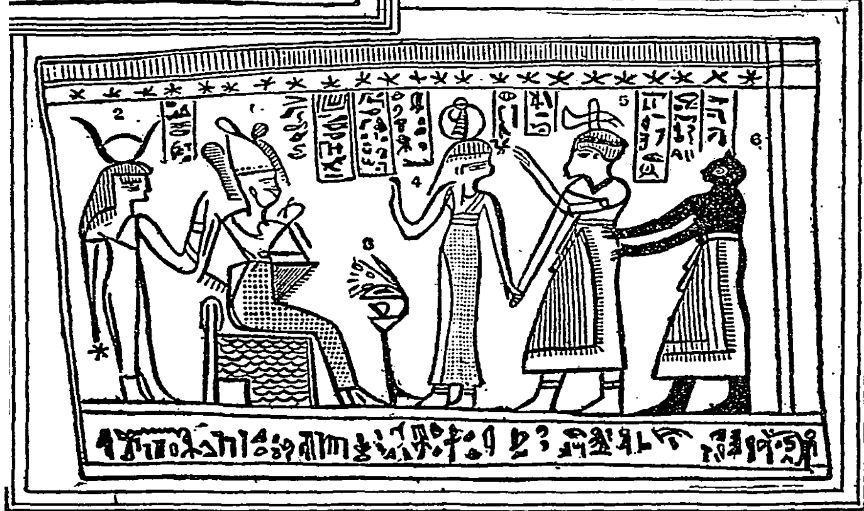
PLATE NO. 3—FROM "THE PEARL OF GREAT PRICE." Mormon Prophet's Translation.

The "Doctrine and Covenants" consists of the laws which God, in His infinite wisdom laid down directly by word of mouth to the Prophet Joseph Smith. No witnesses were called in to