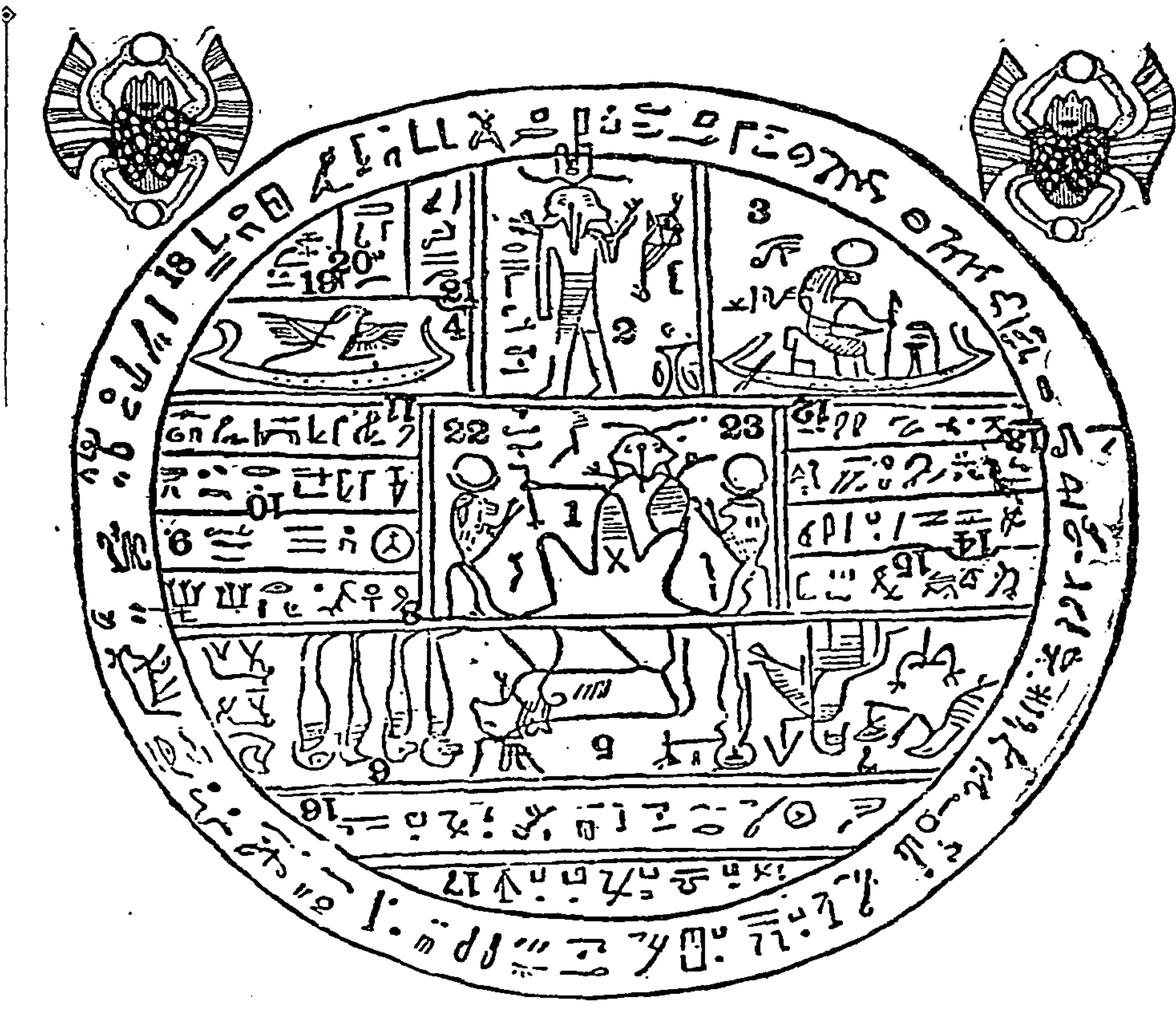
PLATE NO. 4—FROM "THE PEARL OF GREAT PRICE."

"Sad copies of very familiar papyrus," he said, "and a sadder, a much sadder,